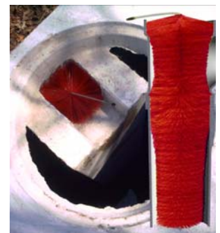
7" Filter in a 5" square concrete baffle